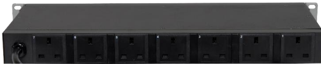
Reverse view of KWX-N16A8UK-H3C20