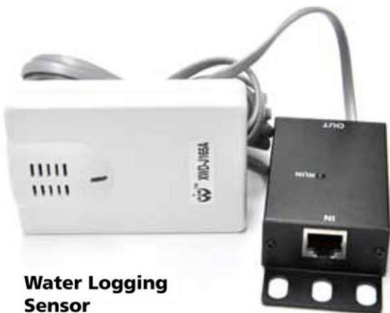
Water Logging Sensor