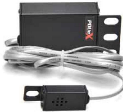
Temperature/ Humidity Sensor