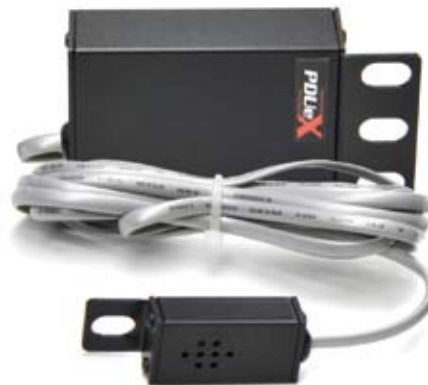
Temperature/ Humidity Sensor