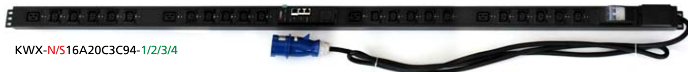
KWX- N/S 16A20C3C94- 1/2/3/4